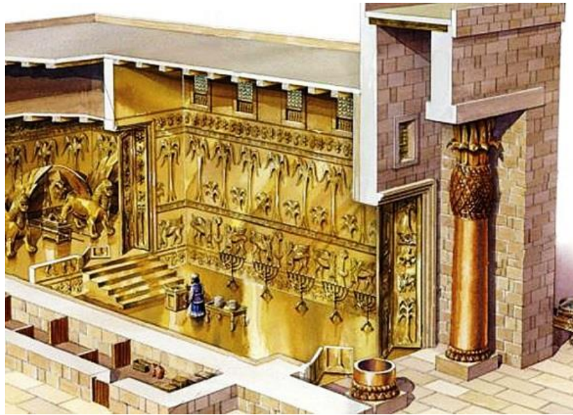
A model of King Solomon's house of God. The "Holy of Holies" is on the left side.